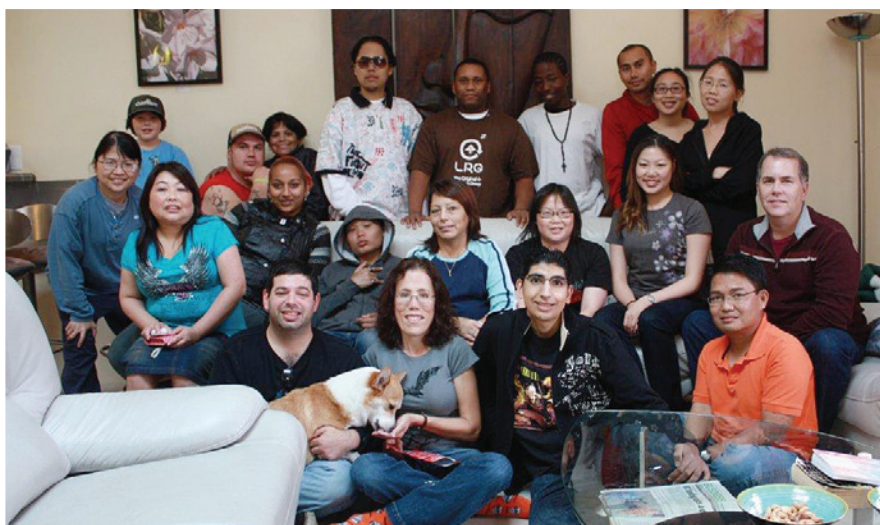
Thalassemia Retreat, 2010

I was excited that there were several first-time attendees as well as many returning attendees. I learned a lot about