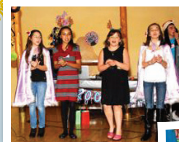
Gotta Sing Performers