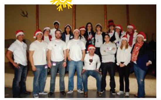
The Titan Group