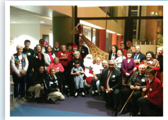
The ICF makes the holidays merrier.