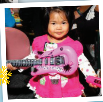
Rockin' at the holiday party.